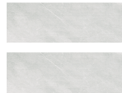
Khan Concept White