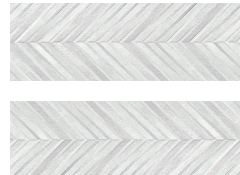
Khan Art White