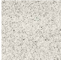
Sale e Pepe